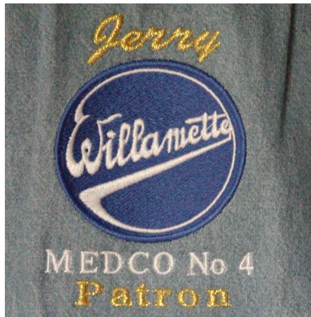
Embroidered design on gift shirts for donations of $1000 or more.