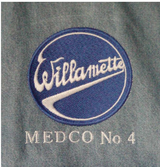
Embroidered design on gift shirts for donations of $500 or more.

In addition to the shirts all donations of any amount received for Medco #4 will be matched.